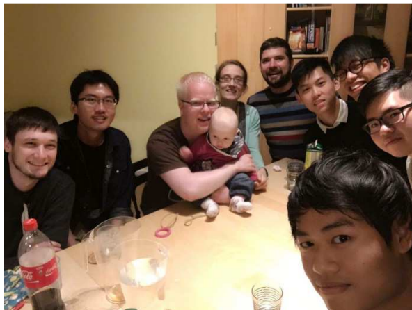
Having dinner in a German family