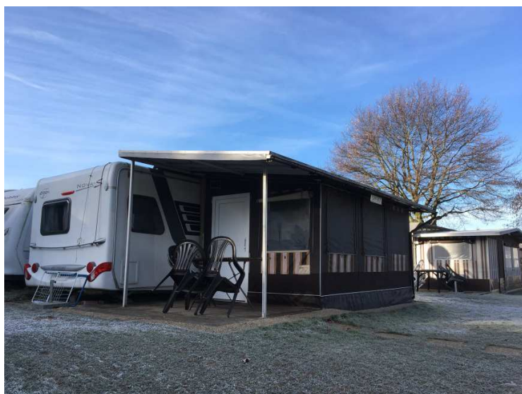
Camping Van in Kirchzarten (Schwarzwald)

The results of final examination in December accounted for a majority part of the final grade. Therefore, I spent most of the time studying in December. After the examination, I went to the Christmas markets in Mannheim and Nürnberg. It was crowded in the Christmas market Nürnberg like the Lunar New Year market in Hong Kong as it is the most famous one in Germany. There is an interesting hot drink in the Christmas market in Mannheim, a cup of hot wine with fire on it. I enjoyed the cuisine in Christmas market such as Gebrannte Mandeln and Langos.