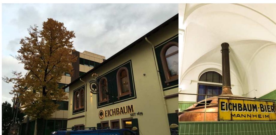
Eichbaum Factory Visit