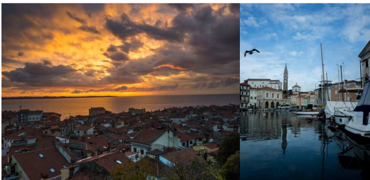
Piran in Slovenia

I travelled to Berlin and Piran in Slovenia. I appreciate how German face and preserve the history and offense during Second World War and like the energetic side of Berlin. Piran is a small coastal town preserving medieval architecture, with narrow streets and compact houses. It was a relaxing town where European people go on vacation. I love the seafood restaurant there.