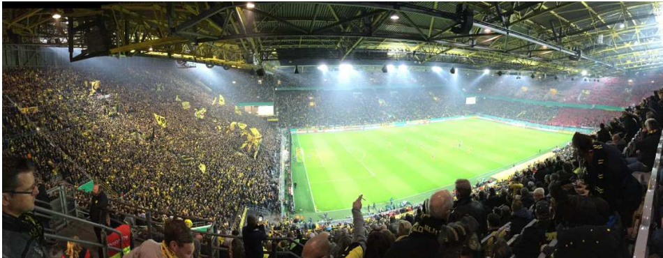
Soccer Match in Dortmund

Germany won the recent world cup and German love watching Soccer match so much. I watched a German Cup soccer match in Dortmund with other German people who are enthusiastic about the teams they support. I shouted the slogans and cheered the team up with other Borussia Dortmund's fans. I enjoyed an exciting match and the lively environment.