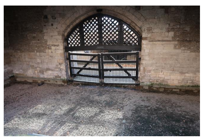
The Traitor's Gate