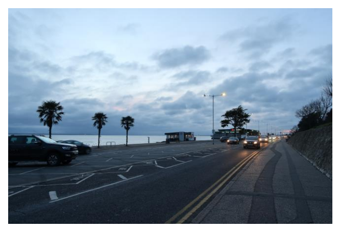
The road to Southend-On-Sea