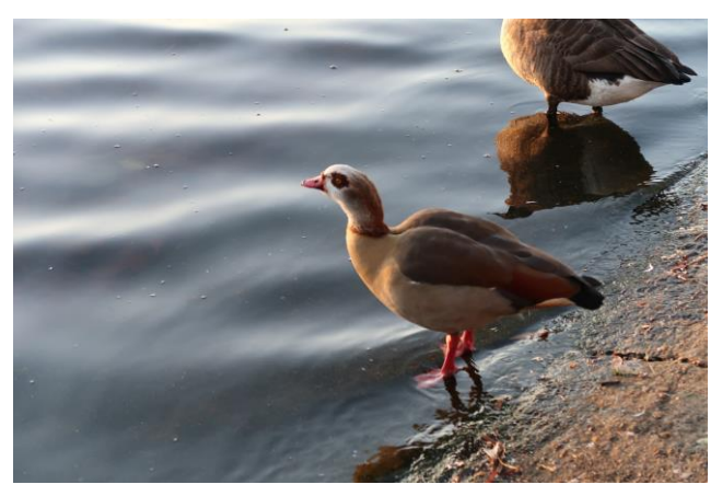
Ducks living in Hyde Park

If you are a fan of natural landmarks or parks then you must not miss Hyde Park. I went there during mid November and it was freezing cold. However, the royal park was not a disappointment when I saw the spectacular and beautiful meadow. It was exceptionally relaxing to sit next to the lake and enjoy a cup of hot coffee.