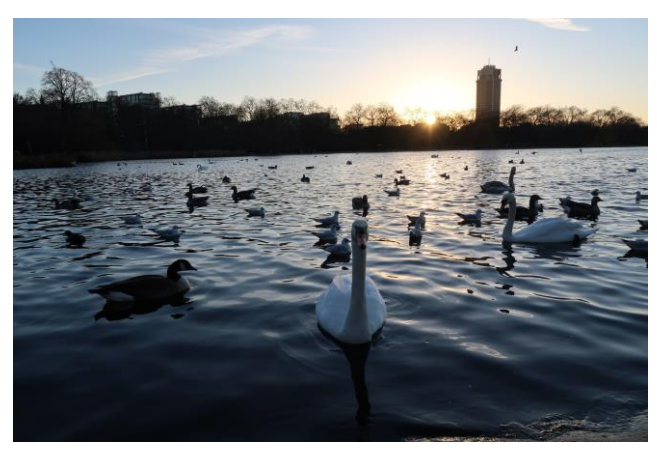
Lake in Hyde Park during Sunset