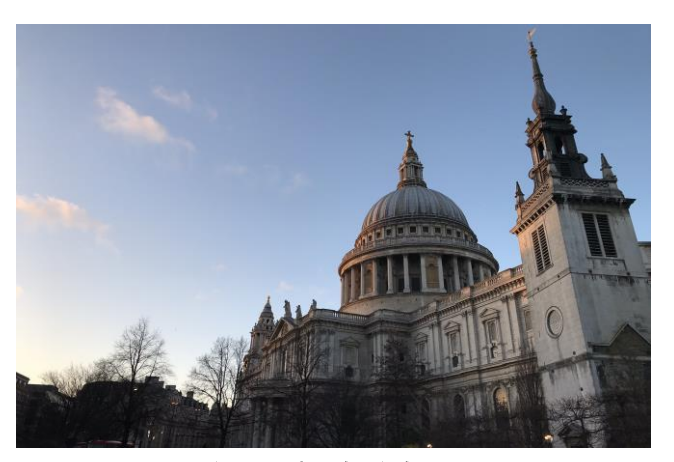
St. Paul's Cathedral during Sunset

I arrived in London on the 26<sup>th</sup> Sep, which was around 1 week before the term started. I checked into Liberty Hall, settled down and was adjusting to the time zone difference. Despite being shattered, I visited the St. Paul's Cathedral on the same day and it was stunning.