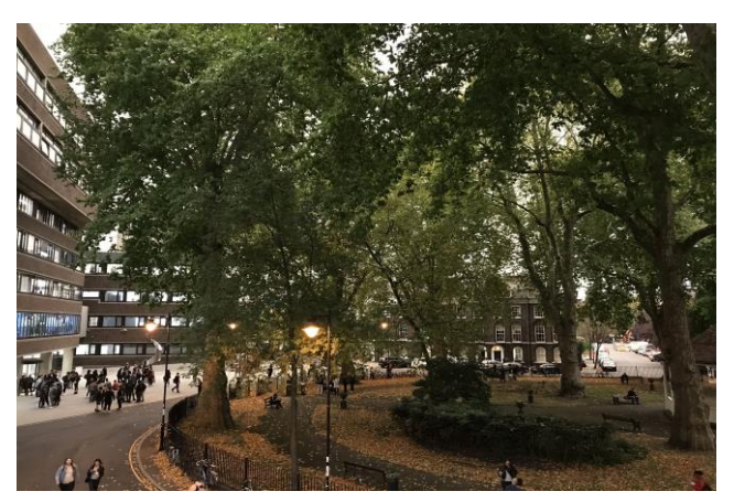
Northampton Square in the University