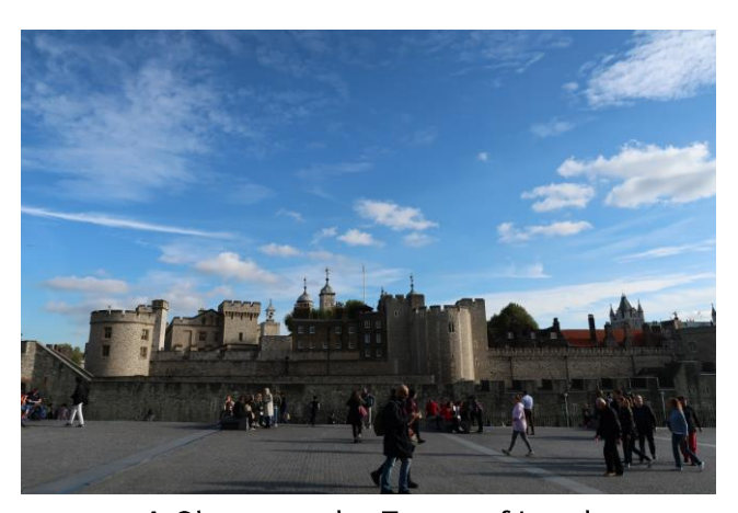
A Glance at the Tower of London

Thanks to the Historic London module I visited quite a number of touristy places in London. One highlight is the Tower of London, which had different usages over time in its history – from a secure fortress to a royal palace and then became an infamous prison and the habitat of the guardians of the Tower – the ravens.