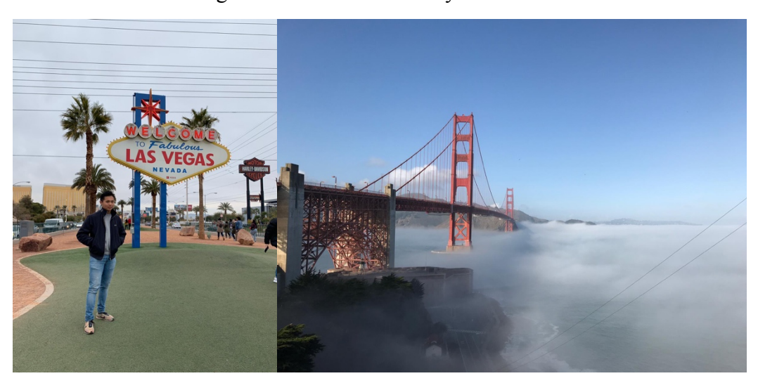
Part 2 General Exchange Information

my courses in Rutgers where professor could let the students vote whether to have final exam or not. Well, as we could expect, no final for that course. General speaking, the finals were quite straight-forward and the materials of courses was not that difficult. If you put some effort in it, I guarantee you would pay off. Another special thing was that, the materials that taught in class were extremely practical. For example, Labs in Econometrics let us have a chance to learn Python and create our own research topic at the end of the semester. After my finals, it was another round of travel with my friends to the West, including Las Vegas, Los Angeles and San Francisco. The exchange was the best time in my life.